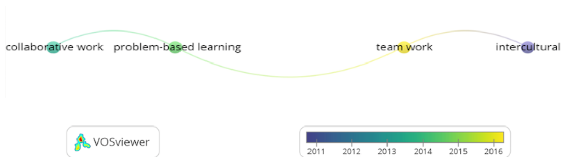
Figure 1 - Clusters of the most recurrent keywords among 125 keywords with most relevant links